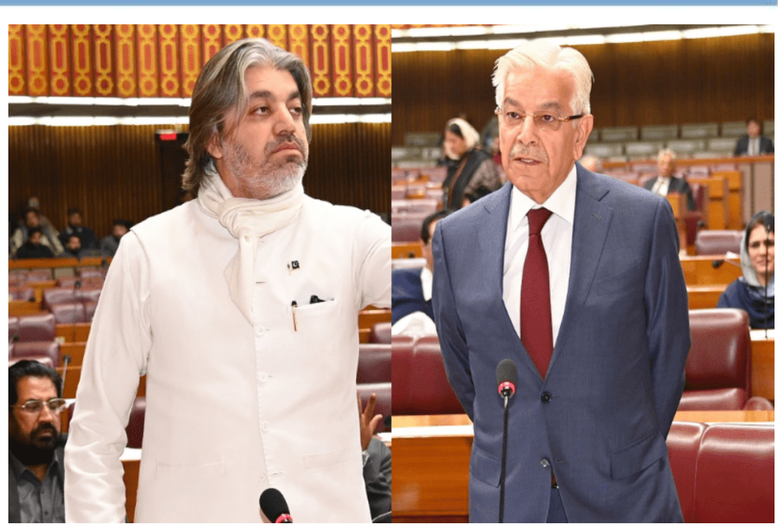
This photo combo shows PTI's Ali Muhammad Khan (L) and Defence Minister Khawaja Asif (R) speaking in the National Assembly

"Speaker Sardar Ayaz Sadiq has always maintained his neutrality. It is as much yours as it is ours," he stressed.Khawaja Asif, while appreciating the shift in tone of PTI, rejected the possibility of dialogue under duress. "You are holding a gun of civil disobedience. Let us cross that bridge and we will talk after that," he said. He also insisted that the PTI first create a "conducive environment" for talks. The defence minister criticised the Khyber Pakhtunkhwa government for prioritising political marches over governance, particularly in the wake of the Kurram clashes.