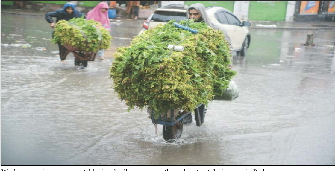
Workers carrying green vegetables in wheelbarrows pass through a street during rain in Peshawar

hear the case as it involved challenges to the constitu-