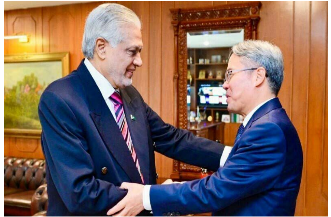
Deputy PM Ishaq Dar pictured with Chinese Ambassador Jiang Zaidong on Jan 28, 2025