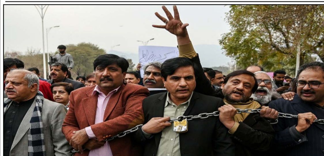
Members of the Pakistan Federal Union of Journalists (PFUJ) shout slogans during a protest against amendments in the Prevention of Electronic Crimes Act (Peca) in Islamabad on January 28.