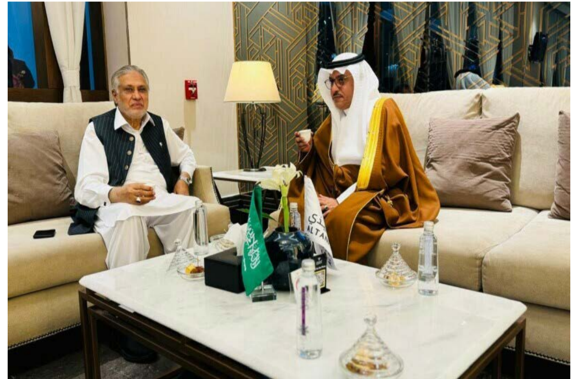
Foreign Minister Ishaq Dar departed from Medinah for Riyadh to attend the OIC Foreign Ministers Meeting

their successful operation in North Waziristan, which resulted in the elimination of six terrorists and the injury of six others. The operation is seen as a significant victory in the ongoing fight against terrorism in the region. In a statement, Bilawal expressed his support for the security forces, saying, "This is a significant victory for our security forces and reflects their ongoing commitment to combating terrorism. He also highlighted the importance of intelligence-based operations in securing the nation