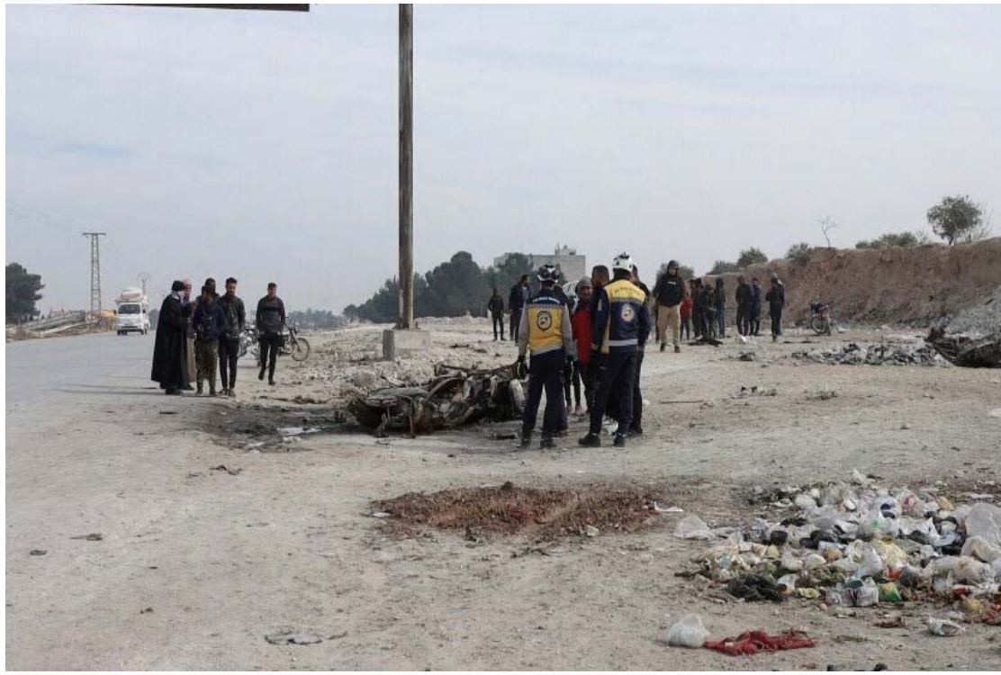
Members of the White Helmets work in the aftermath of a car bomb explosion, in Manbij, Syria, February 3.

While India was slashing peak rates of basic customs duties used for international comparisons, it was adding various surcharges on imports, implying that the total tax burden remained high, he said.