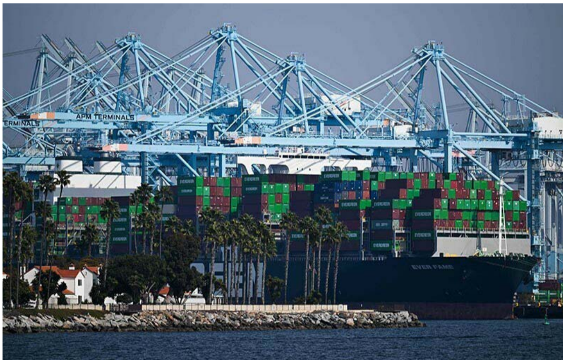
Cargo shipping containers sit on the Evergreen Ever Fame container ship docked at a container terminal at the Port of Los Angeles in Los Angeles, California on February 3.