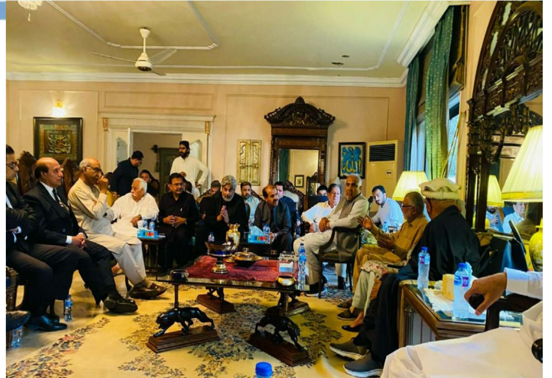
A delegation of the Tehreek Tahaffuz Ayeen-i-Pakistan (TTAP) meets with Grand Democratic Alliance chief Pir Pagara and its leaders in Karachi on Feb 22, 2025.