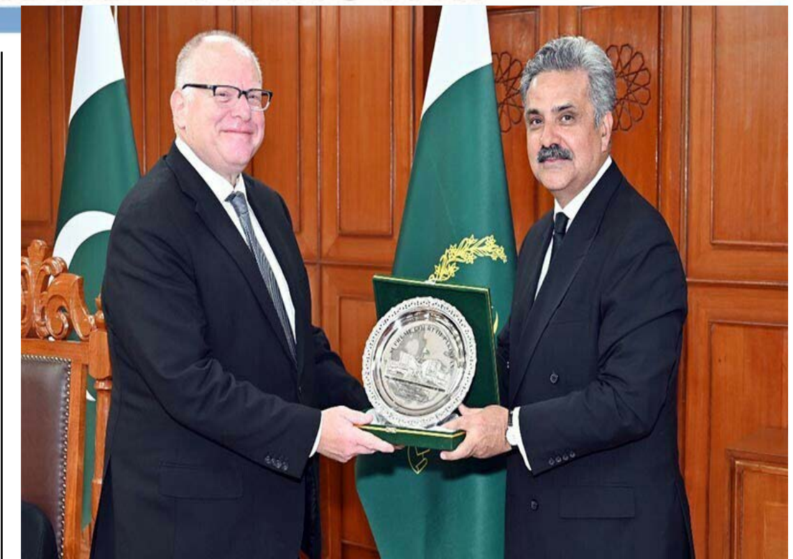
CJP Yahya Afridi presents IMF delegation with a souvenir at the Supreme Court

to ensure a more transparent and efficient judicial selection process."CJP Yahya also informed the delegation that the Supreme Court was in the "process of finalising a critical agenda for the upcoming NJPMC meeting expected in the last week of February." Discussions during the meeting also centered on judicial accountability and the mechanisms for addressing complaints against judges," the report said, adding that the country's chief justice also underscored on "the importance of a robust and fair accountability process" for the integrity and independence of the judiciary.