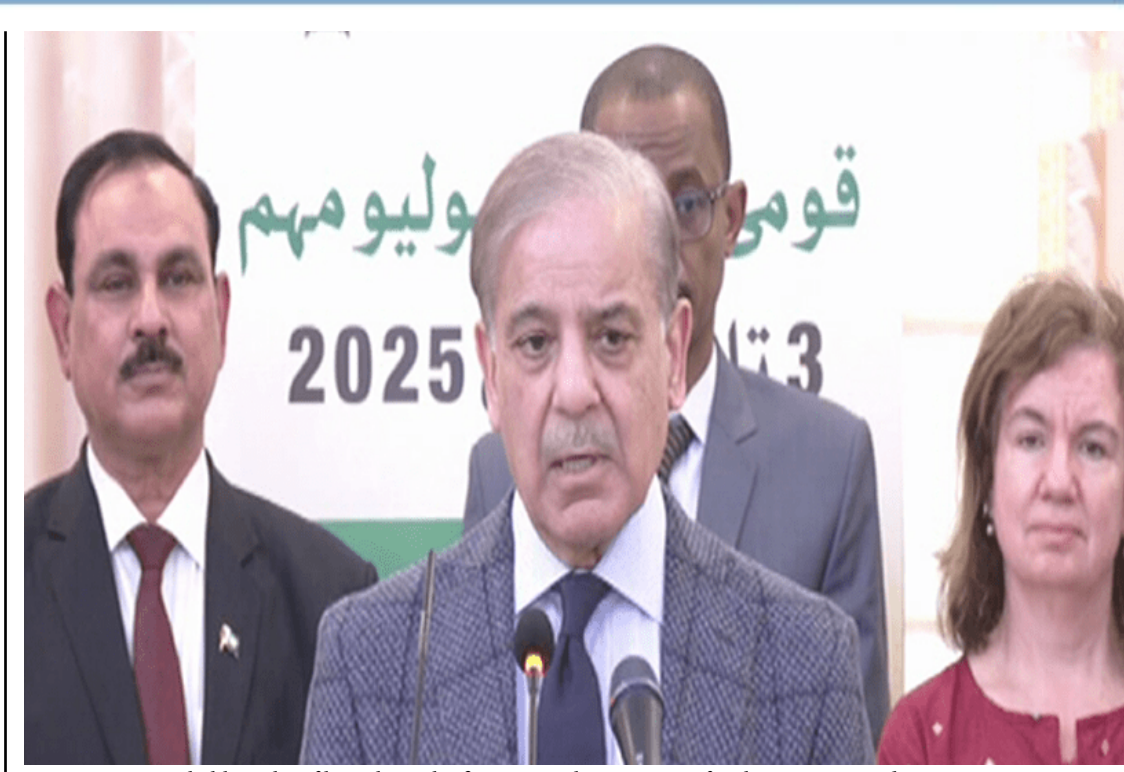
Prime Minister Shehbaz Sharif launching the first anti-polio campaign for the year on Sunda

He appreciated all the in-ternational partners including the World Health Organisation, Unicef, Bill Gates Foundation and the Kingdom of Saudi Arabia for their commitment and efforts to the government in its efforts to eliminate polio.Polio is a paralysing disease that has no cure. Multiple doses of the oral polio vaccine and completion of the routine vaccination schedule for all children under the age of five are essential to provide children with high immunity against this terrible disease.