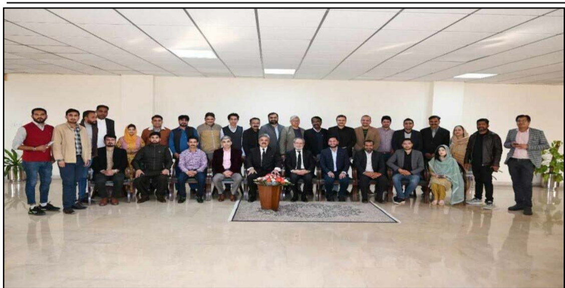
CJP Yahya Afridi in the oath-taking ceremony of the Press Association of the Supreme Court (PAS) today.

bol of federation. A Baloch-speaking judge has joined, a Sindh-speaking judge has joined, so you should rejoice [this moment]," the CJP said, stating that the federation belonged to everyone. "The transfer happened according to the Constitution. It is a good step taken under Article 200," he said. "More judges should come from other provinces," the CJP added. He said that as the chief justice, his vision should be broader and that there was a need for more judges in the SC, highlighting that he heard 40 cases today.