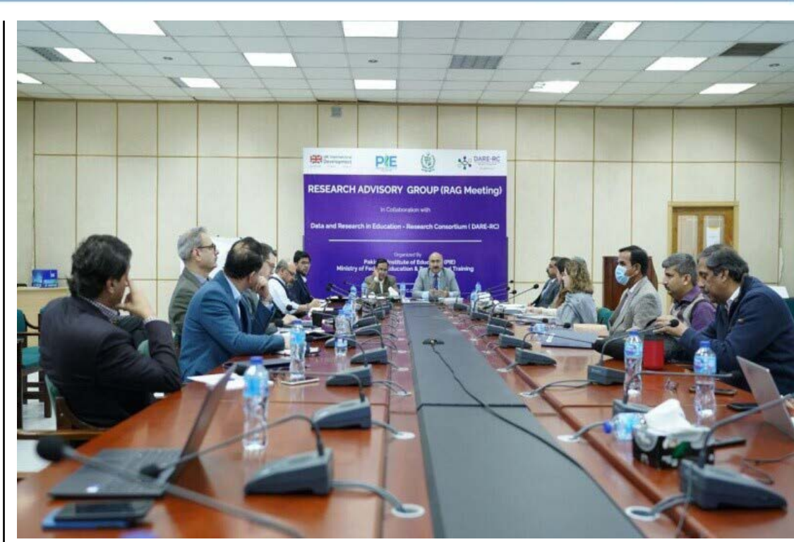
A second meeting of the Research Advisory Group (RAG) was convened at the PIE Auditorium in Islamabad on Tuesday

The ISPR said that expressing solidarity with the "resilient people" of IoK on the eve of Kashmir Solidarity Day, the forum's members strongly condemned the "continued blatant human rights violations" in IoK, recognising them as a "grave threat to regional peace and stability".The army brass reiterated Pakistan's unwavering support for the "legitimate struggle of the Kashmiri people for