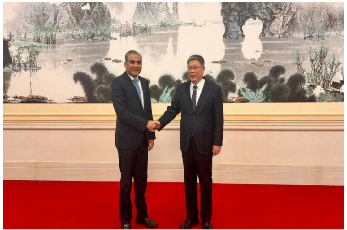
Interior Minister Mohsin Naqvi meets with his Chinese counterpart Qi Yanjun in Beijing, China on Wednesday

ment and technology for the police from China. Cooperation with the National Police Academy was also discussed by the two officials who further decided to increase cooperation between the Beijing Police and Islamabad Police. They also expressed satisfaction over a meeting of the Joint Working Group in January in which the two sides had reaffirmed their commitment to high-quality development of the second phase of the China-Pakistan Economic Corridor (CPEC) with an emphasis on industrialisation, special economic zones, clean energy.