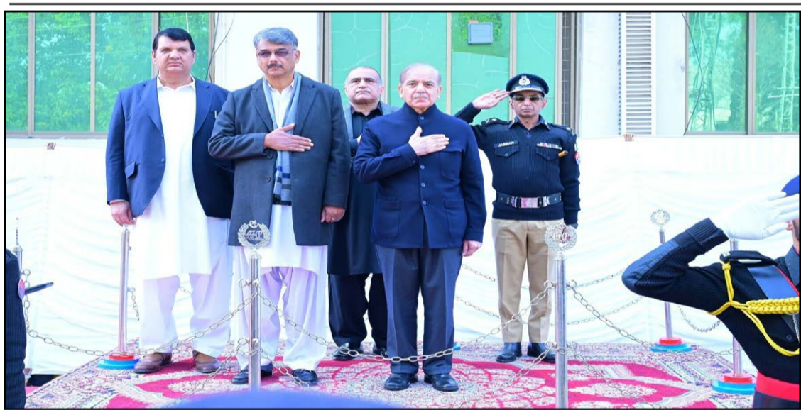
Prime Minister Shehbaz Sharif receives a guard of honour upon his arrival at the AJK Legislative Assembly on Feb 5, 2025

of Pakistan's foreign policy, the premier reaffirmed the country's "unwavering moral, diplomatic and political support to the Kashmiri people till the realisation of their right to self-determination". President Asif Ali Zardari said the day reminded the global community of its responsibility towards the oppressed Kashmiri people, according to Radio Pakistan. The president stated that the United Nations should honour the promises made to the Kashmiris 78 years ago and support their struggle for their right to self-determination.