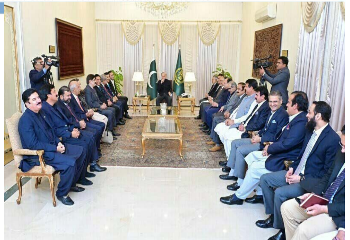
A delegation of the Pakistan People's Party, led by Chairman Bilawal Bhutto-Zardari calls on Prime Minister Shehbaz Sharif in Islamabad on March 10.