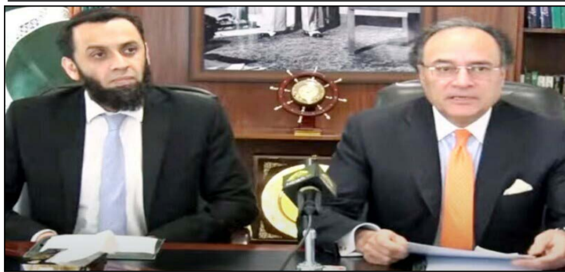
Finance Minister Muhammad Aurangzeb addressing a press conference along with Information Minister Attaullah Tarar on Tuesday

He said that Pakistan had the evidence against Kabul authorities that they "not only tolerated but are complicit in the conduct of TTP's terrorist cross-border attacks". Akram further stated that the TTP was collaborating with other terrorist groups present in Afghanistan, like the BLA and the Majeed Brigade, adding that the latter sought to destabilise Pakistan's ties with China. "The TTP also receives external support and financing from our principal adversary," the envoy said in an apparent reference to India.