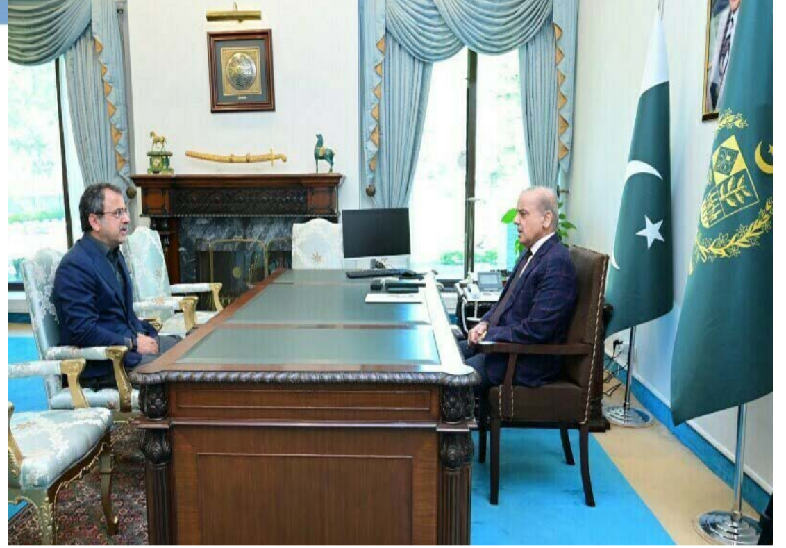
Federal Minister for Power Sardar Awais Leghari calls on PM Shehbaz Sharif on Mar 5, 2025.