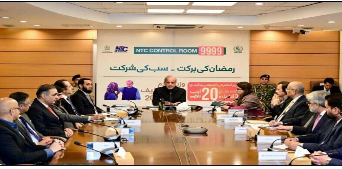
Prime Minister Shehbaz Sharif addresses a meeting to review monitoring of the disbursement of the Ramzan Package 2025 at the National Telecommunications Corporation in Islamabad on March 10.

The disagreement follows a special note issued last week by Nepra's technical member from Sindh, Rafique A. Shaikh, who pointed out that K-Electric's own power plants contributed 19 per cent to its energy mix in December 2024, while purchases from other independent power producers (IPPs) and captive power plants (CPPs) accounted for 7pc, and National Transmission and Despatch Company (NTDC) supplied 74pc of KE's total electricity. "Notably, the cost of generation within the NTDC system is significantly lower at Rs9.60 per kWh (kilowatt-hour), compared to KE's own generation cost of Rs18.63 per kWh," Mr Shaikh said. Says Karachi's power costs could drop if gas quota is restoredWith NTDC possessing surplus generation capacity and its facilities situated close to K-Electric, Mr Shaikh emphasised it was crucial for both KE and the transmission company to prioritise and accelerate the interconnection works and studies between their systems to optimise cost-efficiency and improve overall performance.