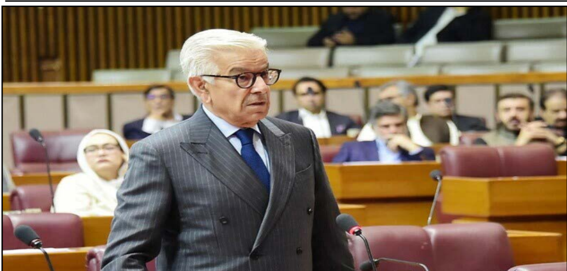
Defence Minister speaks on the recent hijacking of the Jaffar Express train in Balochistan, in the National Assembly, on March 13.

rorists used hostages, including women and children, as human shields,” he added. A group of armed men was patrolling the train and its surrounding areas, keeping an eye on the large numbers of passengers in their custody. SSG commandos acted carefully to save the lives of hostages, and managed to free around 68 hostages after neutralising the remaining terrorists in a gun battle, a senior security official told adding that almost all operations had been completed and forces were now in the clearance phase.