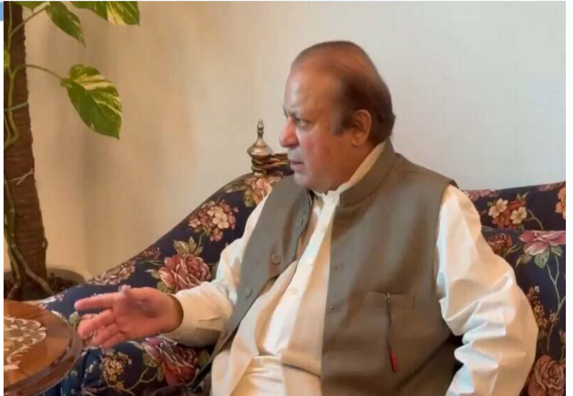
Screengrab of PML-N President Nawaz Sharif speaks to National Assembly Speaker Sardar Ayaz Sadiq in a meeting on Wednesday

government, including Asif, maintained an uncanny silence in the NA over the hijacking, despite scathing criticism from Opposition Leader Omar Ayub Khan, who slammed the handling of the attack that shook the nation. Taking a jibe at Omar Ayub, who is the grandson of former dictator Gen Ayub Khan, Asif said, “Those people mocked us on Form-47 who have had three martial laws, whose elders abrogated the Constitution of Pakistan for the first time.”