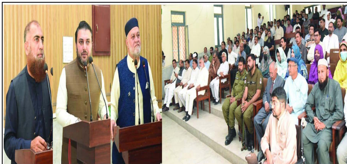
Federal Minister for poverty alleviation and social safety syed imrana ahmad shah addressing the gathering as chief guest on teachers honour day at govt graduate college sahiwal.

rected the Ministry of Foreign Affairs to contact the families of the deceased Pakistanis and Pakistan’s embassy in Iran for the safe return of their bodies. According to reports, unknown armed men barged into the workshop sometime in the night and, after tying their hands and feet, opened indiscriminate firing at the workers and killed them. Later, the attackers fled from the site. The Iranian police rushed to the area after receiving information about the tragic incident, and after recovering the bodies, they were shifted to the hospital.