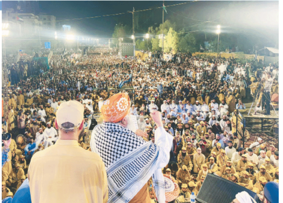
JUI-F chief Maulana Fazlur Rehman speaks at the event. in Karachi to condemn Israeli brutalities