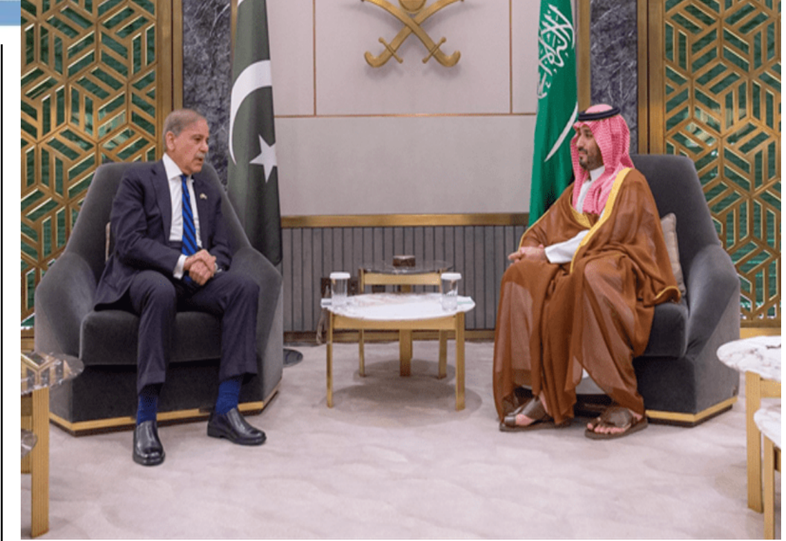
Prime Minister Shehbaz Sharif meets Saudi Crown Prince Mohammed Bin Salman on Thursday

heights and transforming it into a mutually beneficial economic partnership," he continued. "Lauded the pivotal role played by His Royal Highness and the Kingdom in efforts to bring peace in the Middle East and in Ukraine."The high-level delegation accompanying the premier includes Deputy Prime Minister and Foreign Minister Ishaq Dar, Chief of Army Staff General Asim Munir, Punjab Chief Minister Maryam Nawaz, federal ministers and senior