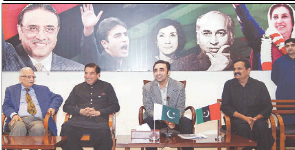
PPP Chairman Bilawal Bhutto-Zardari addresses party workers and activists in Lahore

The committee also scrutinised funds allocated to the ministry of housing and works that lapsed at the end of the fiscal year due to delays in their release. The secretary of housing and works attributed delays to the late release of final grants. Committee miffed at irregularities in PWD, delays in release of funds to housing ministry Expressing frustration over delayed disbursement of funds by the finance ministry, PAC member Naveed Qamar said this was a "mockery" that funds were released on June 26, four days before the end of the fiscal year. The committee questioned finance ministry officials on whether the lapse was anticipated and summoned the secretaries of finance and planning ministries to address procedural flaws. The meeting also reviewed audit objections related to the ministry of housing and works. The auditor general's report highlighted financial mismanagement exceeding Rs33.65 billion in the ministry and its subordinate bodies.