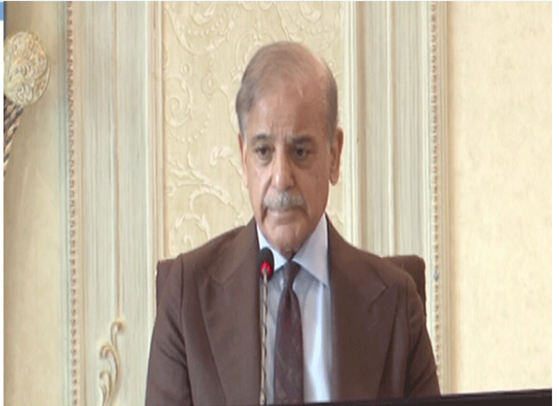
Prime Minister Shehbaz Sharif speaking at a federal cabinet meeting on Wednesday

Agricultural Income Tax Bill. Punjab and Khyber Pakhtunkhwa had already passed the amended agricultural income tax law that was a part of the federal government's commitments under the IMF's $7bn agreement spanning 37 months. IMF deal brings total disbursements to about $2bn Earlier today, the federal government reached a deal with the IMF for a new $1.3bn arrangement and also agreed on the first review of the ongoing 37-month bailout programme, the Fund had confirmed on Tuesday.