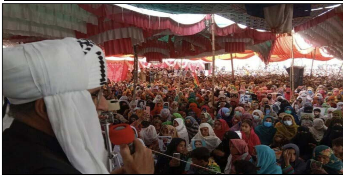
BNP-M chief Sardar Akhtar Mengal addresses demonstrators during a sit-in in Lakpass on April 2.