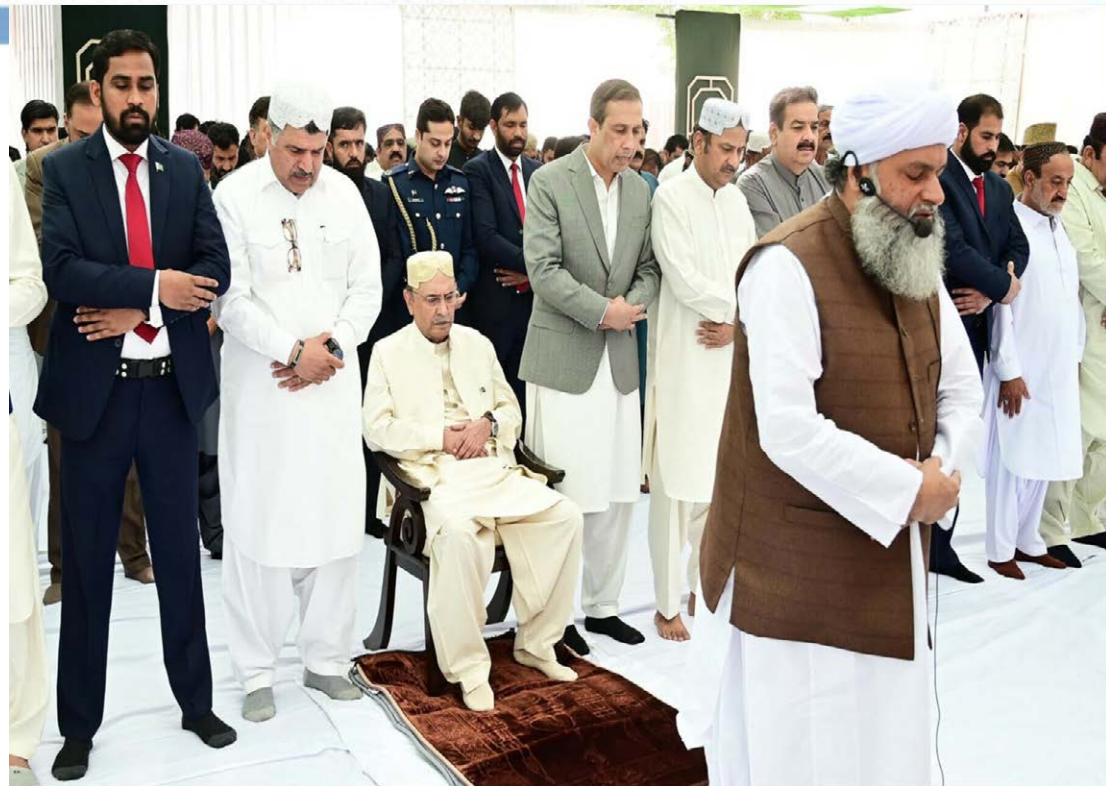
President Asif Ali Zardari has tested positive for coronavirus and is currently in isolation, according to a statement issued by the presidency on Wednesday.