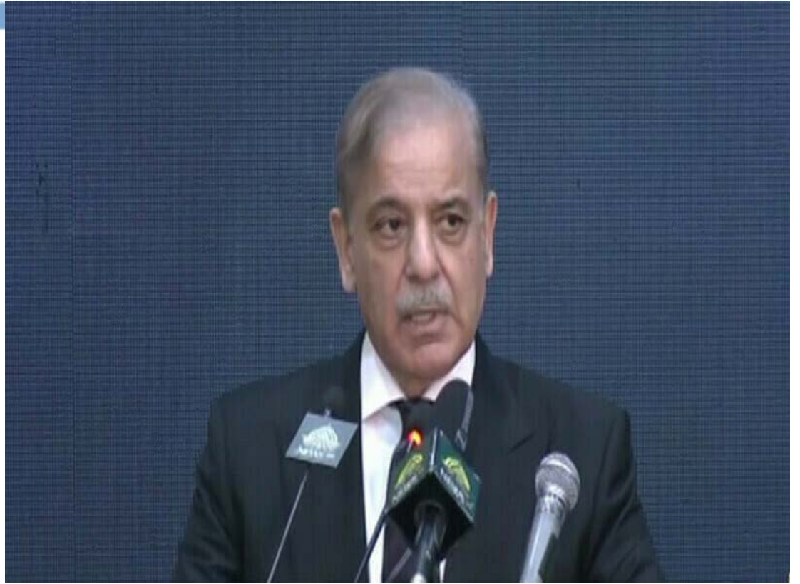
Prime Minister Shehbaz Sharif addresses an event in Islamabad on April 3, 2025

presided over a meeting on the power sector in light of a last-minute hiccup after a substantial reduction in electricity tariffs could not get past the Fund. The premier reiterated that a cut in electricity tariffs would "be announced soon". It may be noted that the government had decided to maintain the petroleum prices at the existing level — instead of an up-to-Rs13 per litre cut worked out by the oil regulator and the petroleum division — promising to transfer its financial impact to electricity consumers.