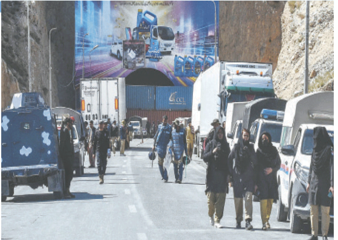
Security personnel are stationed outside the Lakpass Tunnel on Sunday, which is blocked with shipping containers to prevent BNP-Mengal protesters from marching towards Quetta

Concluding his message, the Prime Minister urged all stakeholders including civil society and development partners to integrate sports into policies related to education, health, development, and peace.